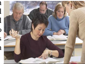
Education Department 314-275-7888

The Education Department is a professional development resource and offers a state of the art facility. Agents acquire designations such as Graduate, Real Estate Institute (GRI) and Certified Residential Specialist (CRS), as well as attend specialized seminars. Most importantly, the Education Department offers continuing education courses, both on-line and in classroom format, for license renewal required by the Missouri Real Estate Commission every two years. All of these programs give REALTORS® an edge in the marketplace.