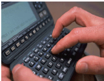
Multiple Listing Service 314-984-9111

One of the most important and necessary tools that the Association offers is the Multiple Listing Service (MLS) supplied by Mid America Regional Information Systems. It is a comprehensive database of properties throughout St.