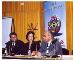
Panel discussion during 2001 Summit