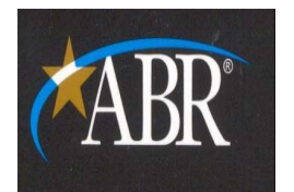
2002 Summit Education Providers