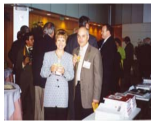
Key representatives from Mexico at the 2001 Summit

Schedule of events is tentative and subject to change.