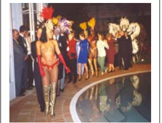
Attendees enjoy a reception during the 2001 Summit

Cancellations must be made in writing and faxed to NAR International at 1.312.329.8358 by September 1 for a full refund. No refunds can be made after September 1.