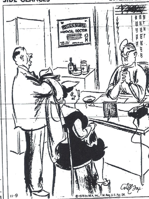
"I know medical science can't solve all our problems but her bridge club is working on it!"