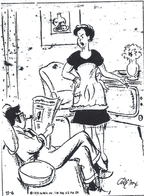
"I don't think you even CARE that the TV conked out just as Gloria was wheeled into surgery!"