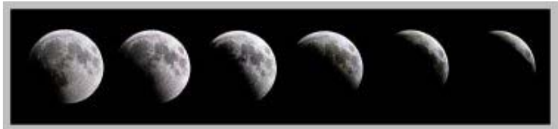
1992 lunar eclipse